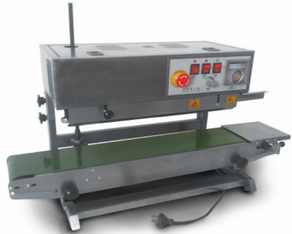
Vertical Band Sealer EF-800HS-Vert

Whatever the application, Dextron Heatshrink has a system to suit all products. Call us to discuss your requirements.